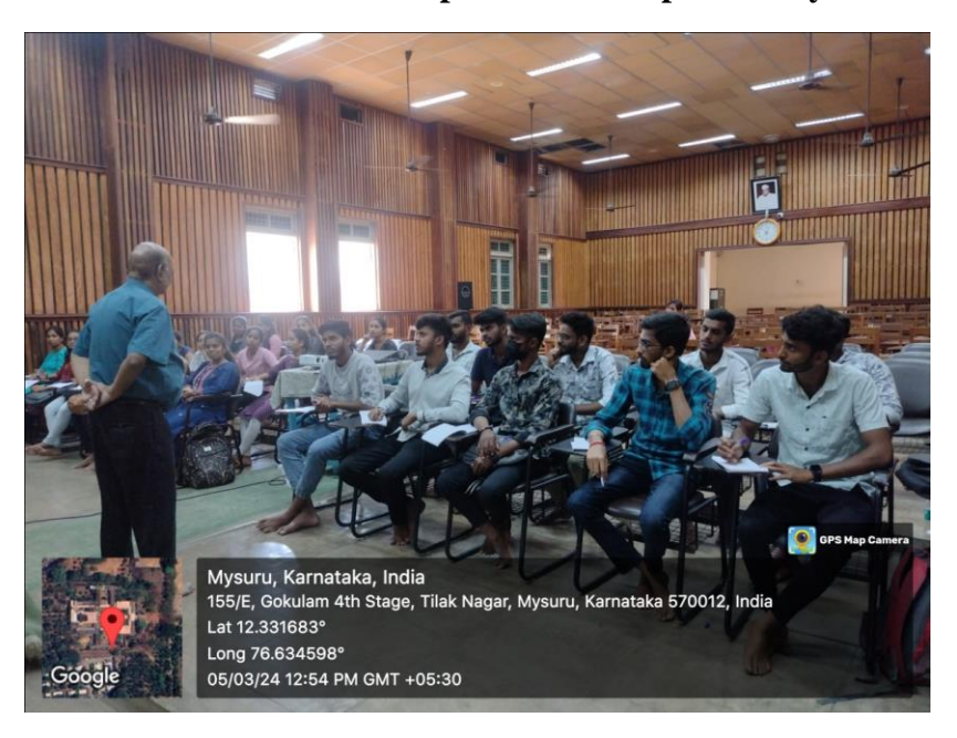
Lecture Series 3: Handling Failures - by Swami Mahamedhananda